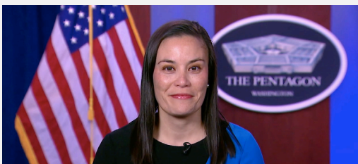
WHAT YOU NEED TO KNOW GMA3 FIRST EXCLUSIVE WITH THE FIRST OUT LESBIAN WOMAN OF COLOR TO SERVE AS AN UNDER SECRETARY IN THE U.S. MILITARY abc

Project LPAC's advocacy efforts expanded into the Presidential appointment process, including providing direct support and guidance to potential LGBTQ women appointees. We led a group of 14 LGBTQ organizations which urged the Biden-Harris Administration to appoint more LGBTQ women, LGBTQ people of color, and transgender people as U.S. Ambassadors. We were particularly proud to work closely with Gina Ortiz Jones as she was nominated and confirmed as the Under Secretary of the Air Force.